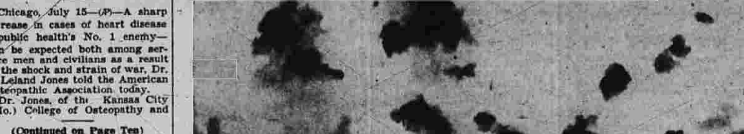
The U. S. aircraft carrier Yorktown (left) and an escort ship of a Pacific task force threw up an umbrella of anti-aircraft fire as Japanese torpedo planes attacked the carrier in the Battle of Midway Island. A column of smoke (center) rises from a Jap plane that crashed into the sea after being shot down.