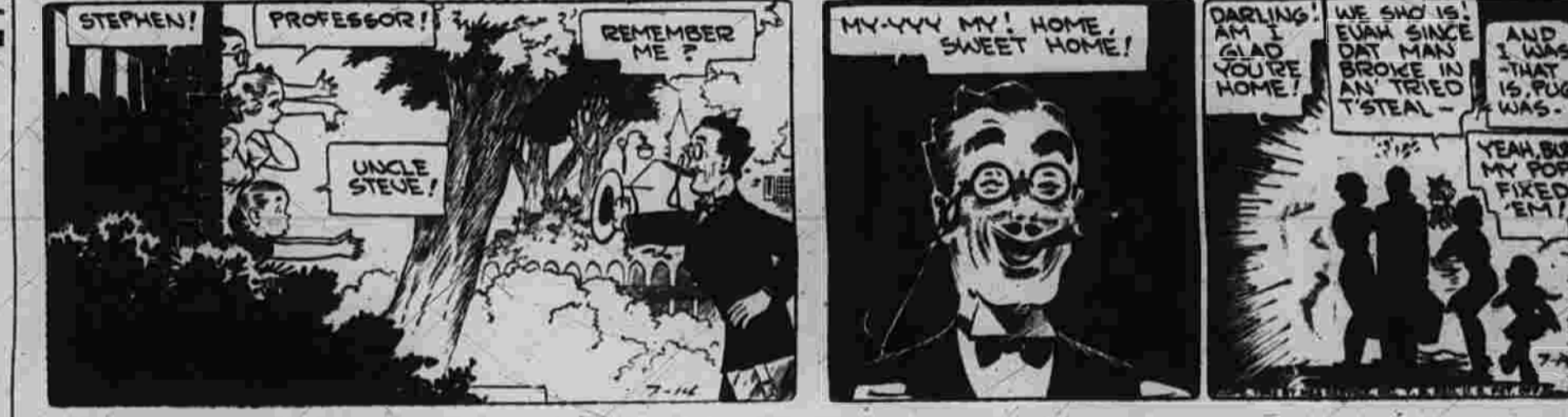
BOOTS AND HER BUDDIES BY EDGAR MARTIN