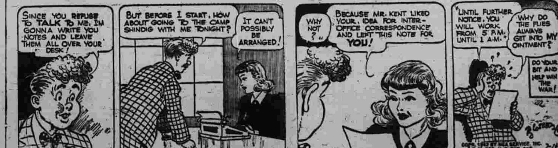
WASH TUBBS BY MERRILL BLOSSER