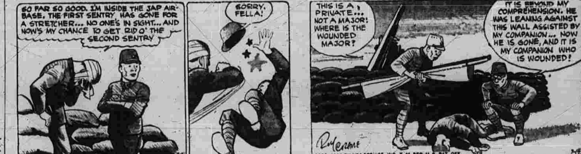
WASH TUBBS BY ROY CRANE