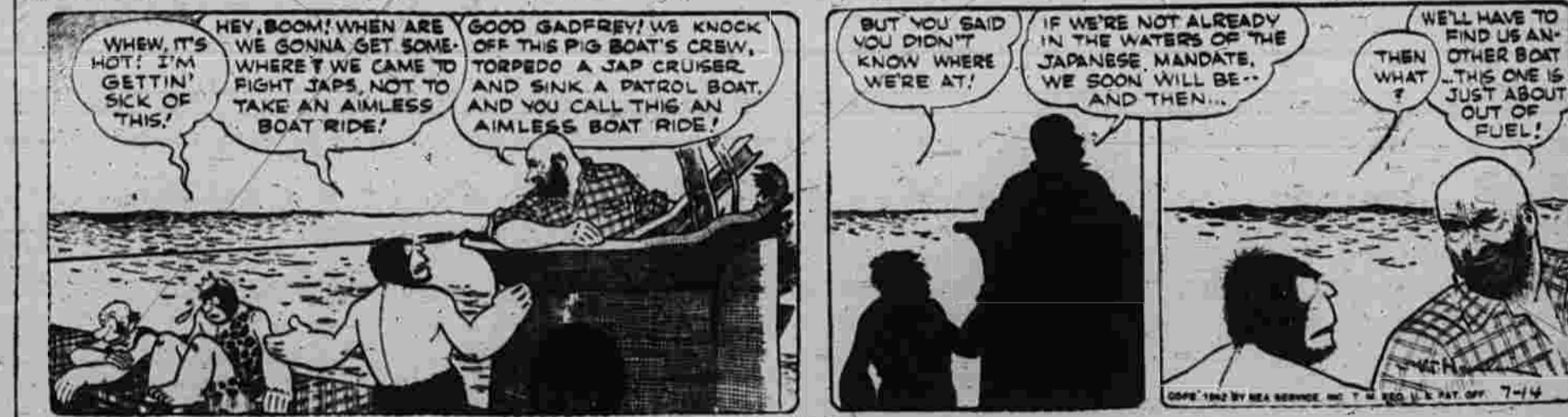
WASH TUBBS BY V. T. HAMLIN